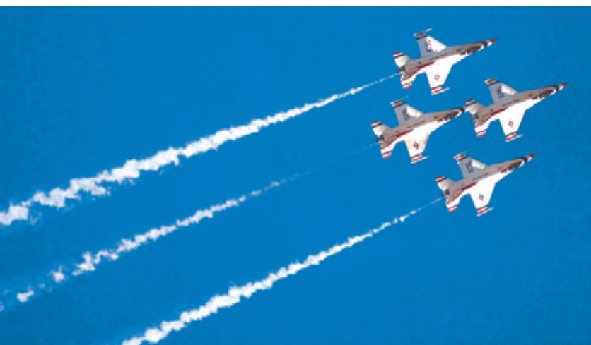
Florida International AirShow